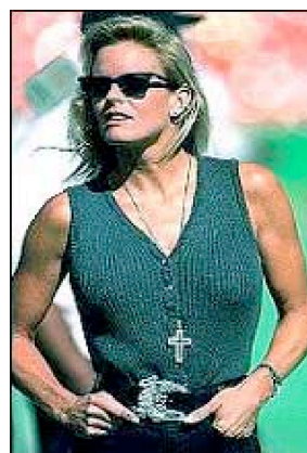
Nicole Brown Simpson

The accuracy of DNA testing and the assumption that the blood could only come from the one offender became very important. When identifying the origin of DNA in paternity tests, the following fundamental theory is used. An individuals DNA profile consists of measurements on several markers, each yielding a genotype which consists of a pair of alleles, one inherited from the father and the other from the mother. It is impossible, however, to tell which allele came from the mother, and which came from the father. This theory can be used at crime scenes when there is mixed trace blood. The alleles can help to distinguish the people who have contributed DNA to the mixture. This module will explore the following problem: Given a DNA mixture at a crime scene and given the DNA of a suspect, how likely is it that the suspect was in fact the offender? You will have to consider possible contamination and whether the fact that the suspect might be a close relative of the offender might affect the analysis. Bayesian networks will be used to model the different scenarios, and to produce likelihoods for the guilt (or innocence) of the suspect. In order to use Bayesian networks, you will also learn the basics of conditional probability and Bayes Rule.