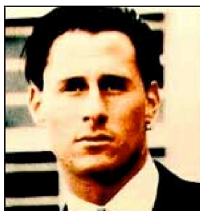
Ronald Lyle Goldman