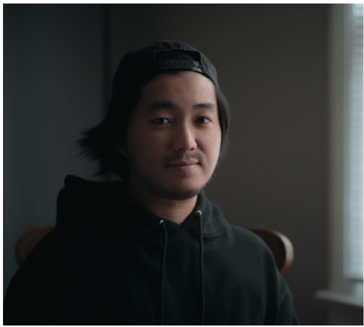
What kind of sentiments or emotions do you feel when you are in the process of editing?

Make sure to support Amodh on Instagram: @ amodh